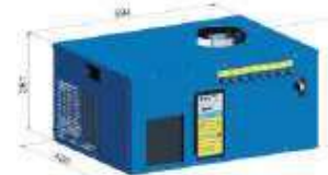
TORNADO SHELF 18