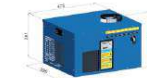
TORNADO SHELF 11

Single box Dimensioni/Dimensions 64x54xh36,5 cm Peso/Weight 33 Kg