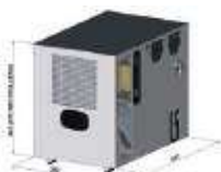
GEO 20/L ORIZZONTALE/HORIZONTAL