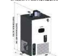
GEO 30/L VERTICALE CARENATO VERTICAL CASING