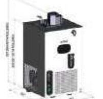
GEO 20/L VERTICALE CARENATO VERTICAL CASING