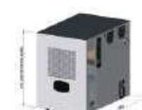
GEO 30/L ORIZZONTALE/HORIZONTAL