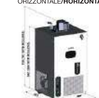
GEO 30/L VERTICALE CARENATO VERTICAL CASING